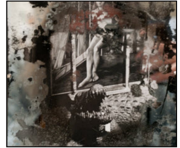
Cynthia Rettig "Bronze Alligator"

Tucked away in the northeast corner of the main gallery I discovered Cynthia Rettig's 50-50 "Nature Series" exhibit, an eclectic selection of photographs behind mirrors, in which portions of the mirror coating had been strategically removed to reveal a section of the image. When I took the photos of the exhibit, I felt as if it was