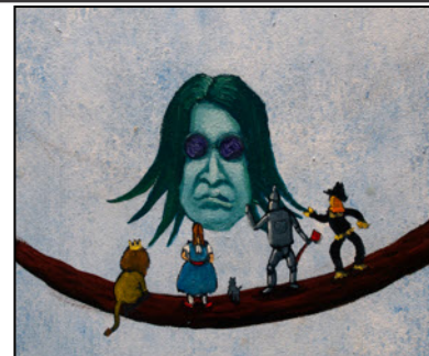
Bill Gallo "Untitled"

into his lighter side to provide "princess empowerment". The branches of his tree are populated with strange little gnome-like creatures from the other side. It's the kind of fairytale world that a favorite uncle would paint to amuse the kids...oil, acrylic and lots of fun.