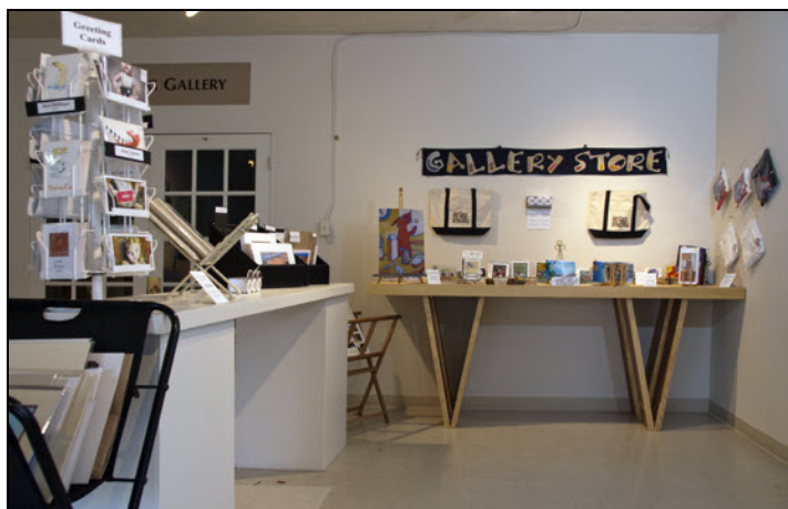
The Gallery Store in the East Gallery