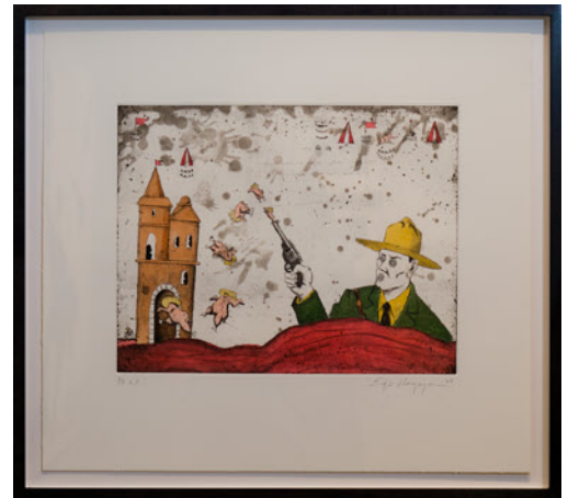
"Border Patrol on Acid" 2007 Enrique Chagoya Etching and Aquaprint with Hand-Colored Acrylic

His work can be found in many public collections, including the Museum of Modern Art in New York, the Metropolitan Museum, the Whitney Museum of American Art, San Francisco Museum of Modern Art, and the Fine Arts Museums of San Francisco.