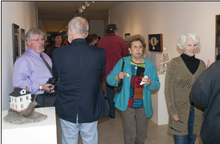
Attendees at the 2012 Buddy Show Opening Reception - West Gallery