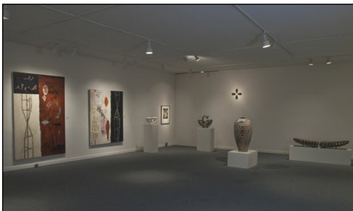
2010 & 2011 Rydell Fellowship Winners The Main Gallery