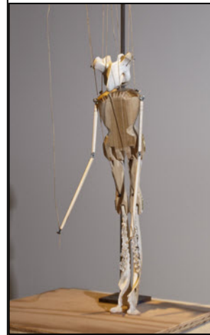
Niki Ulehla "Devil"

display of all the marionettes used in the performance and prints by the artist. You can also visit Ms. Ulehla's website where you can find out more information and view a video performance of the show.