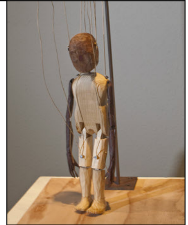
Niki Ulehla "Dante"

If you were not able to attend, you can see a video display at the entrance to the Main Gallery as well as a