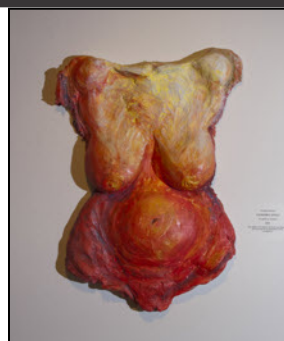
Kristine Idarius "Vulnerable Shield"

You simply must visit the Art Center's East Gallery to see a splendid exhibition by the Peninsula Chapter of the Women's Caucus