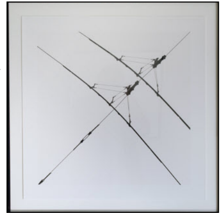
"Composition #113" Ryan Bush- Digital Pigment Print

Ryan Bush, a Los Gatos photographer, has included works from his series titled "Compositions" , an insightful study of overhead wires in which Bush transforms the mundane utility lines into "hidden mysteries, music and the devine."