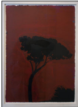
Stan Taft "Roma Tree 7"