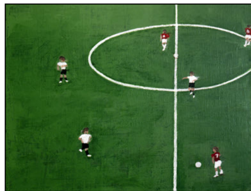
Helge Ternsten "The Pitch"

The Pitch represents not only an interplay of soccer players on a green field, but a match between minimalism and bright colors in acrylic on canvas by Helge Ternsten.