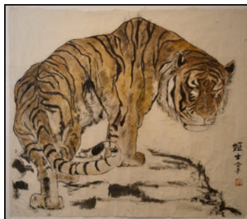
Gisela Rabdau "Year of the Tiger"

There are many more works in this exhibit that are definitely worth visiting. The show runs through Oct 17 or you can view more of the work on our web page www.artguildofpacificca.org .