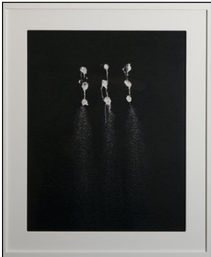
Myles Kleinfeld "9 Dots"