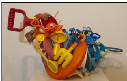
Rig Terrell "Pull Pull"

For those of us living in Pacifica, Thomas Ekkens' photograph titled New Blue lets us see our day to day and sometimes controversial plastic containers