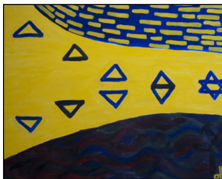
Otto "The Evolution of the Star of David"

In Otto's oil on canvas, triangles converge between seas of colorful patterns and swirls only to join and become The Evolution of the Star of David .