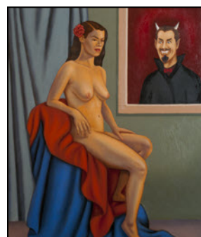
Basil Brummel "Beauty and the Beast"

For those of us living in Pacifica, Thomas Ekkens' photograph titled New Blue lets us see our day to day and sometimes controversial plastic containers