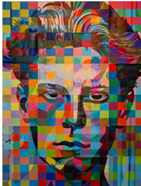
Group Color Project