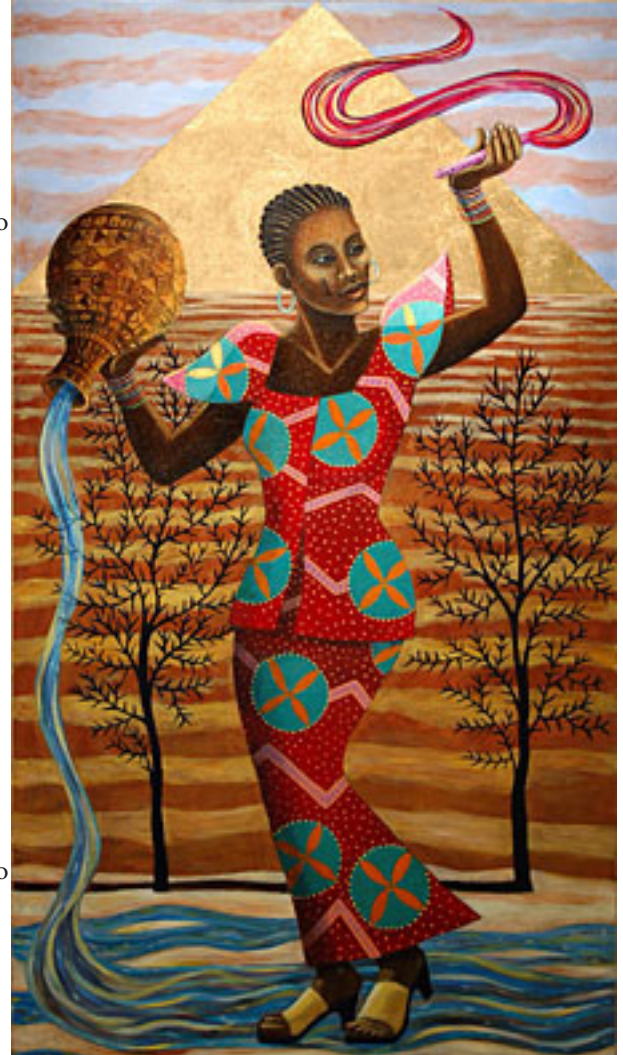
“Woman With Painted Gourds” (upper left) “Self Portrait in Cienfuegos” (lower left)