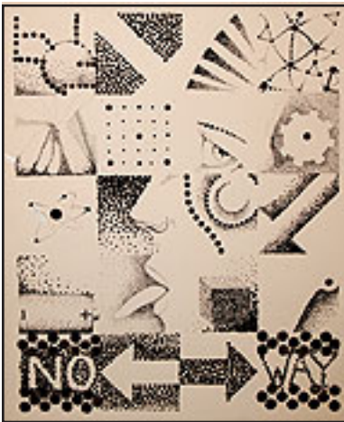
Cody Vrosh "Dot & Grid Pattern"

Perhaps the most interesting piece is the "Group Color Project" which dominates the back wall. A black and white photo of a face was cut into 24 parts and each student received one of the sections. The students then had to enlarge their section and translate the black and white image into various colors. The finished piece is a large absorbing work, well worth a second look.