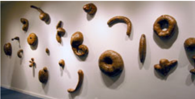
“Tiny Dancer” (top)